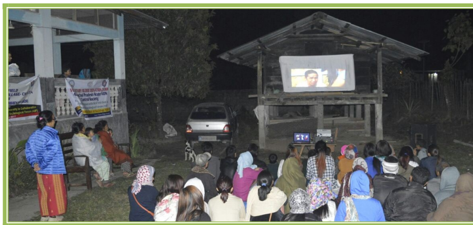
Evening entertainment session with villagers

Students and NSS volunteers has participated the 3 days “Special Camp” held at the Chimpu an adopted village of RGU-Community Development Cell under the aegis of Unnat Bharat Abhiyan. They have organized awareness programme, shramdhan, blood donation, sanitation and cultural programmes at the village. It was led by HoD and faculty of Sociology along with NSS Unit.