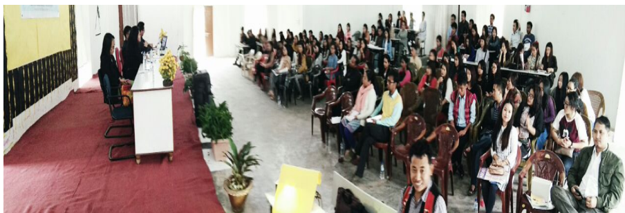
Panaromic views of the programme

A one day awareness programme on Beti Bachao Beti Padao was organized at RGU Mini Auditorium in collaboration with RGNIYD, Seriperumbudr, Tamil Nadu.