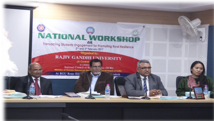
Guest and Resource Persons of the Workshop

Two-day national level workshop on ' Transacting Students on Engagement for Promoting Rural Resilience ' was organized by NSS Unit and Department of Social Work in collaboration with National Council Institute of Rural Institute (NCRI), MHRD-GoI, Hyderabad on 2 nd February 2017. The objective of the workshop was to identify the gaps for curriculum inputs in the rural engagement of students, preparation of a draft module for curriculum inputs in identified higher education streams and evolving a methodology for transacting these curriculum inputs in identified higher education streams. The inaugural programme was attended by Prof. K C Kapoor and Dr. W G Prasanna Kumar Chairman NCRI as chief guest and guest of honour respectively. Prof. RM Pant, Director of NIRD&PR, Guwahati delivered a workshop keynote address. The participants were from various central and deemed Universities of North Eastern region: Nagaland University, Mizoram University, Manipur University, TISS Guwahati, Tezpur University, NEHU, NIT, NERIST and NSS programmes officers of various colleges. It was participatory methods was applied for the workshop. The participants identified gaps and developed curriculum for three subjects. The workshop was coordinated by John G Gangmei and Gomar Basar. It was successfully organised with an active support from faculty members and students of three departments: Social Work, Mass Communication and Education.