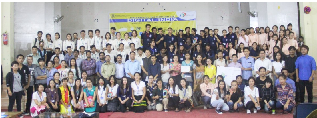
Digital India Workshop Participants

Digital India Workshop was organized by the NSS Unit in collaboration with National e-Governance Division, an independent division of Department of Electronics and Information Technology (DeitY), and Department of Youth Affairs at Rajiv Gandhi University (RGU) on 20th September 2016. The workshop was participated by faculty, students and NSS volunteers from RGU affiliated colleges. The colleges were the Government Women College (GWC), Dera Natung Government College (DNGC), Don Bosco College (DBC) and Vivekananda Kendra College of Teacher Education (VKCTE) and RGU NSS volunteers.