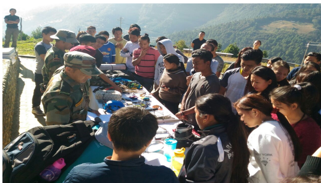
Army Officers (Trainers) Describing Mountaineering Tools to NSS Volunteers

Ten days “Mountaineering and Adventure Camp” from 1 st to 10 th November 2016 at NIMAS (National Institute of Mountaineering and Allied Sports), Ministry of Defence, GoI, at Dirang, Arunachal Pradesh organised by NSS Regional Office of Guwahati for NSS volunteers of two state of North East i.e. Arunachal Pradesh and Nagaland.