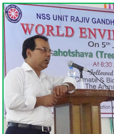
Chief Guest and Resource Person of WED