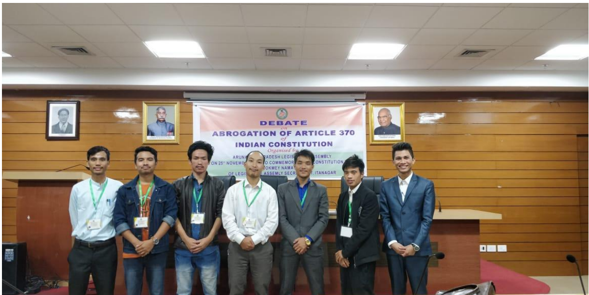
Students Participating in the Debate on the topic Abrogation of Article 370