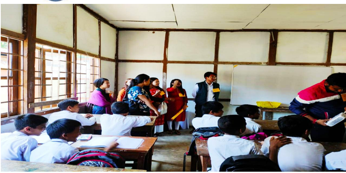
A Select Group of Participant 'Narrating Folk Tales'