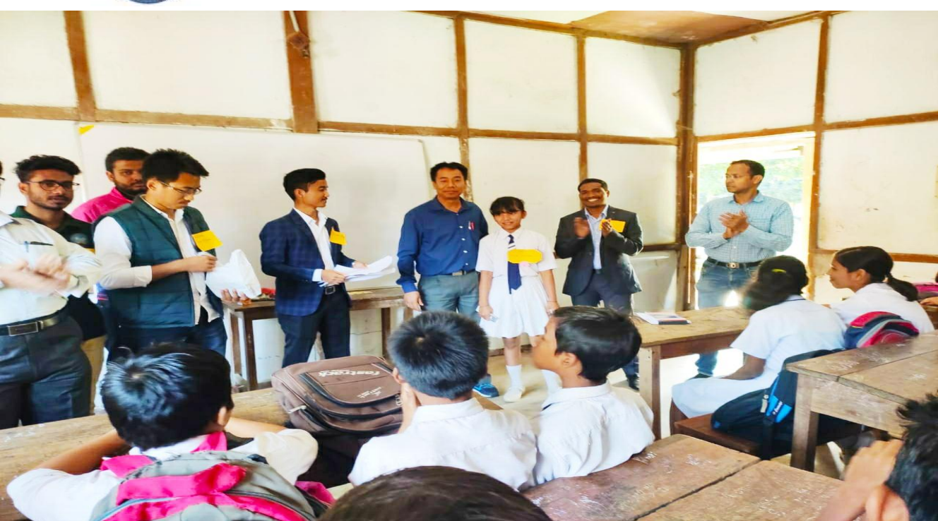
First Prize "Memory Game"

The activities were enjoyed thoroughly by the school students and one of them shared his feeling as, "It was just not learning but fun and celebration"