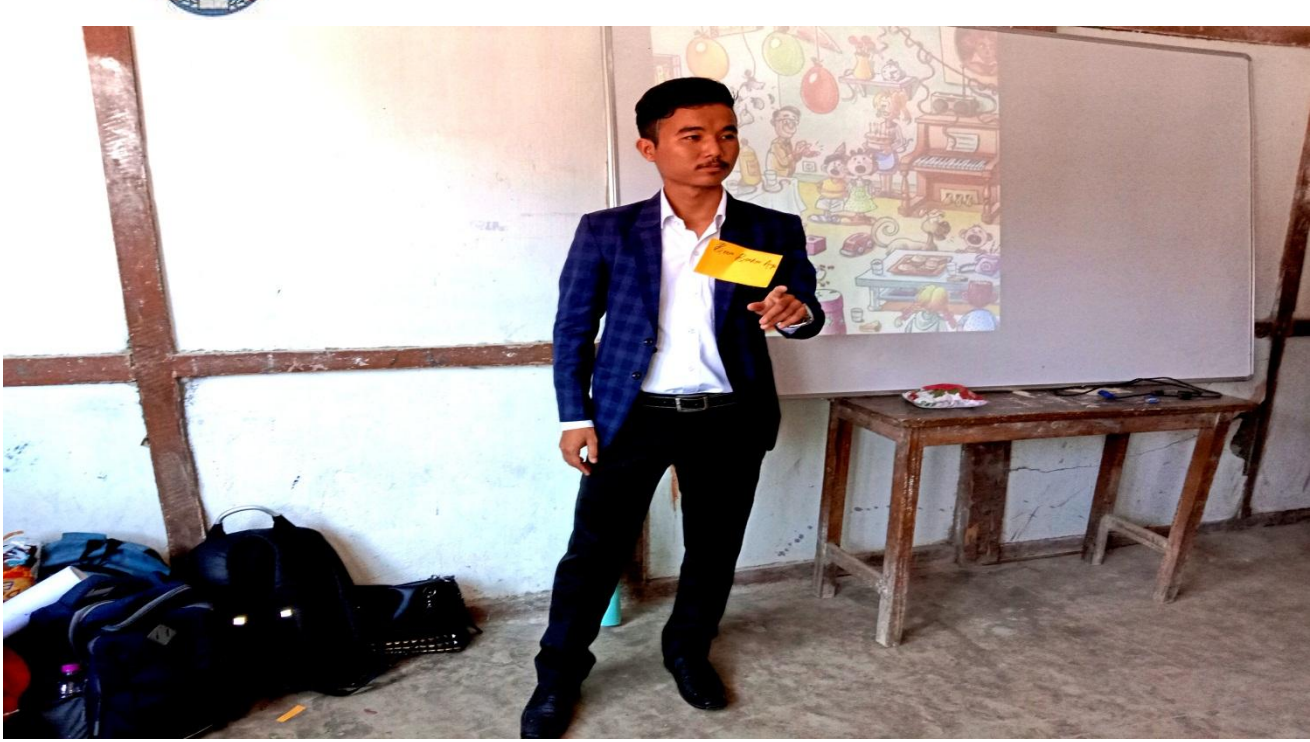
Memory Testing- Game

Task- 2: The school students were shown a picture on the screen with certain details and asked to write a story based on it. The objective of the task was to work on the students' comprehension and imagination, their creativity. The participant teachers also assisted them with certain explanations - mostly suggesting key words and sentences to complete the story. The outcome of the task was almost the whole class came up with a different interpretation of the same picture. The task also helped the students to check their vocabulary and writing ability.