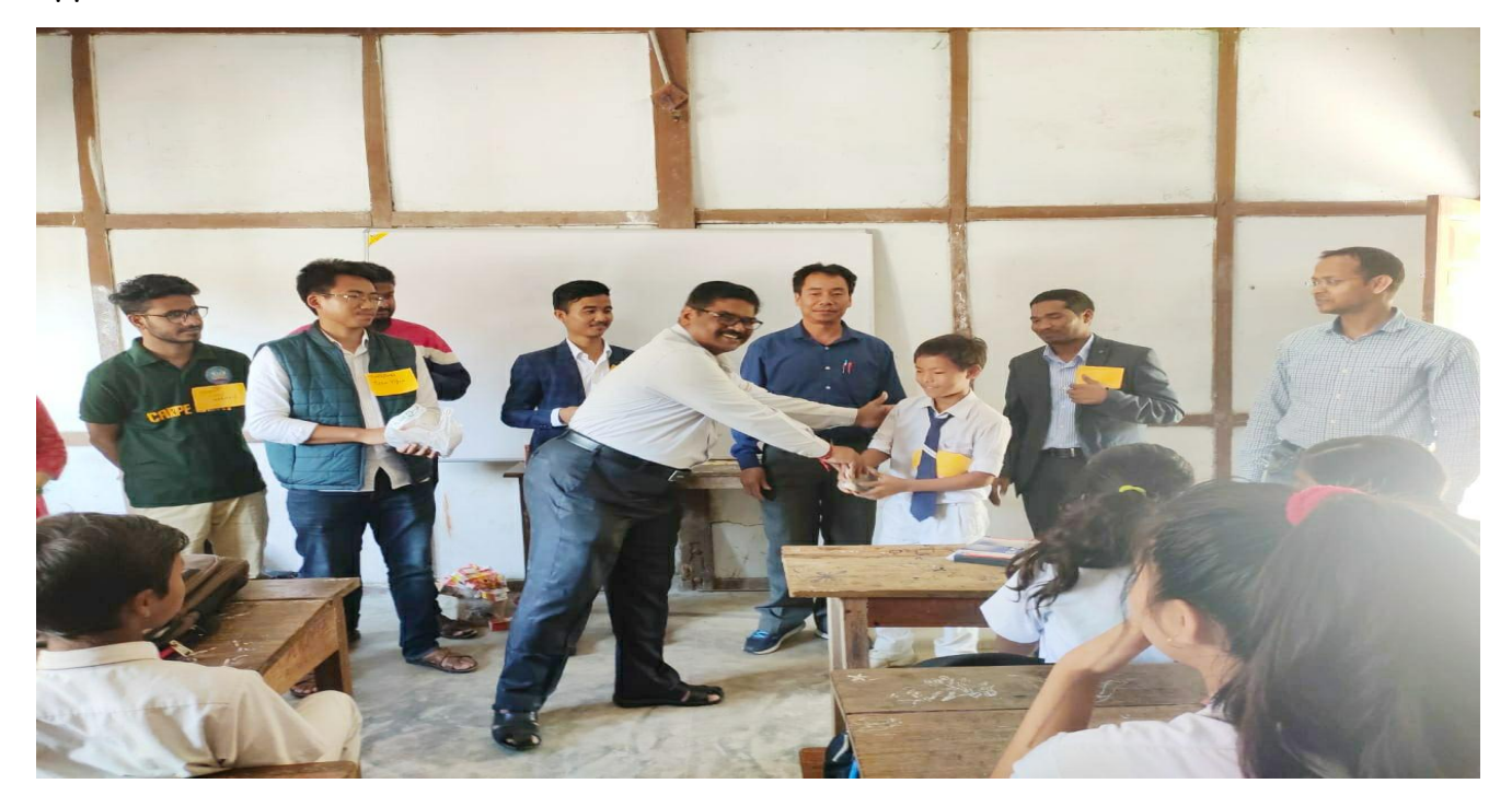
First Prize "Guided Writing"

At the end of the game the group coming with the most appropriate paragraph was chosen as the winner and awarded with a prize as a motivation and appreciation.