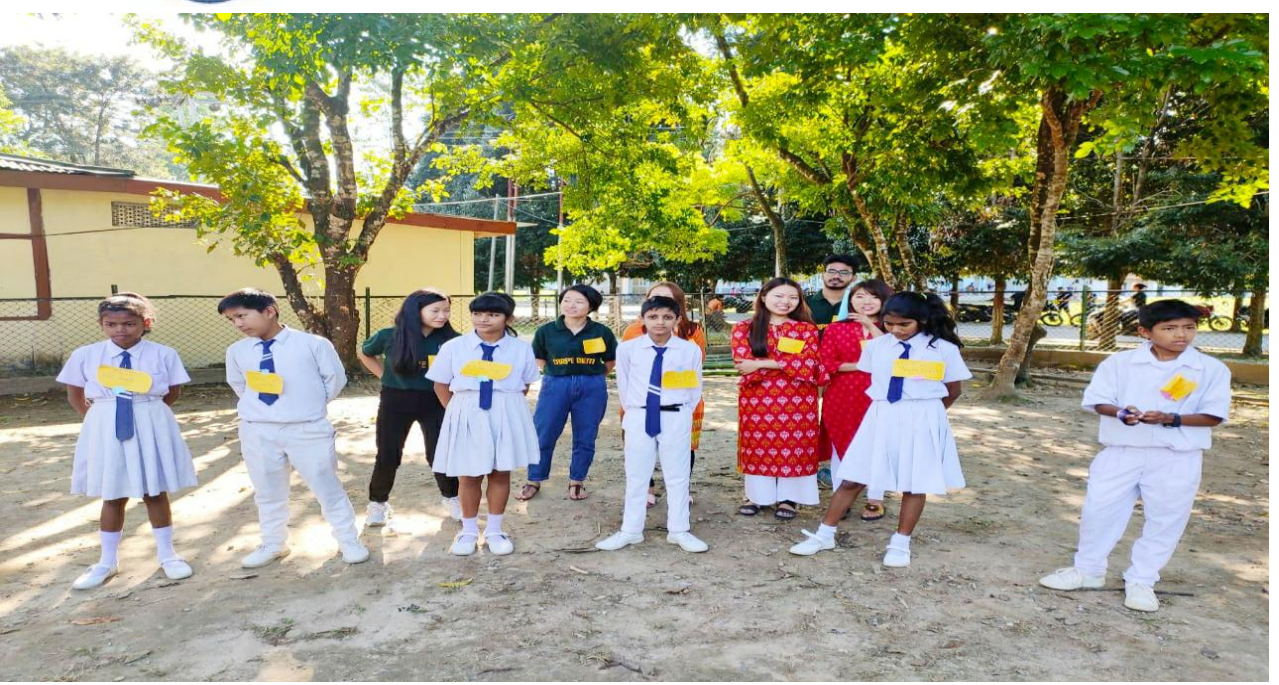
Students waiting for their turn for "Running Dictation"

At the end of the game the group coming with the most appropriate paragraph was chosen as the winner and awarded with a prize as a motivation and appreciation.