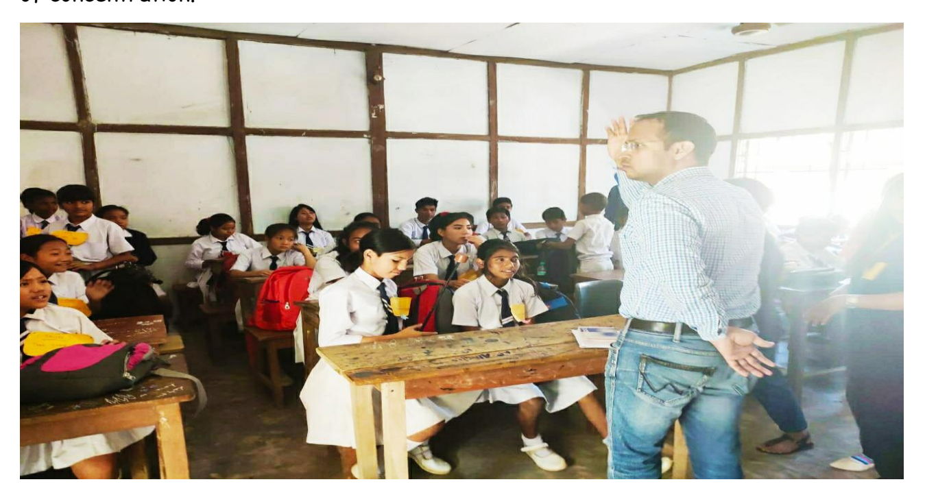
"Simon Says- Ice-Breaking Game"

During icebreaking game the school students were also explained the importance of concentration.