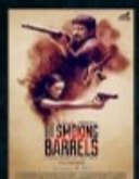
Ill Smoking Barrels Dir: Sanjib Dey ASSAM 2 hours 7 mins

Superhero film from Arunachal inspired from the animated character of Orunasol Man