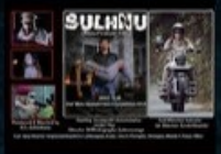
Sulhnu Dir: KC. Zoherlano MIZORAM 83 mins

When the students spoke, a voice raised to protect their land