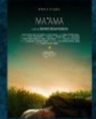
Ma.Ama Dir: Dominic Megam Sangma MEGHALAYA 1 hour 47 mins

Implications of World War I on tribal life and the struggles of the transition to modernity