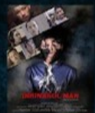
Orunasol Man Dir: Nyago Ete ARUNACHAL PRADESH 1 hour 30 mins

A film charting a tribal woman's pursuit for happiness and love