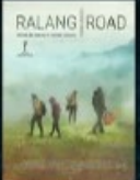
Ralang Road Dir: Karma Takapa SIKKIM 1 hour 43 mins

The last folksongs - the fading memories of origin, love, war and agriculture