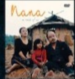
Nana Dir: Tikumzuk Aier NAGALAND 1 hour 40 mins

An autobiographical short film exploring gender discrimination