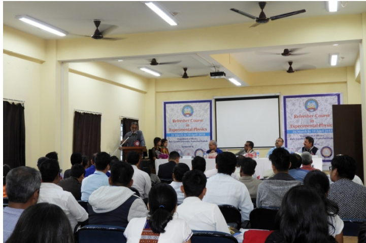
Inauguration of Course