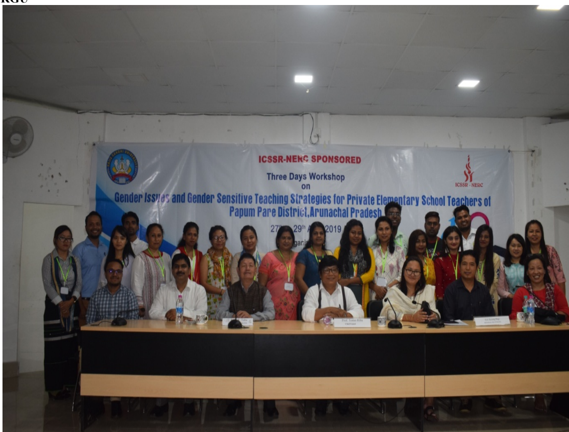
Participants with Registrar RGU, Dean Dept. of Education, Dean DSW and Co-coordinators of the Worksho