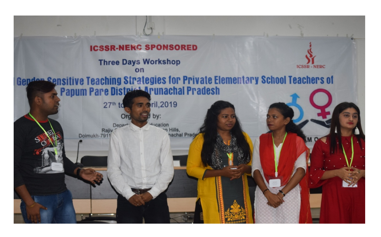
Participants preparing a strategy for the Role Play