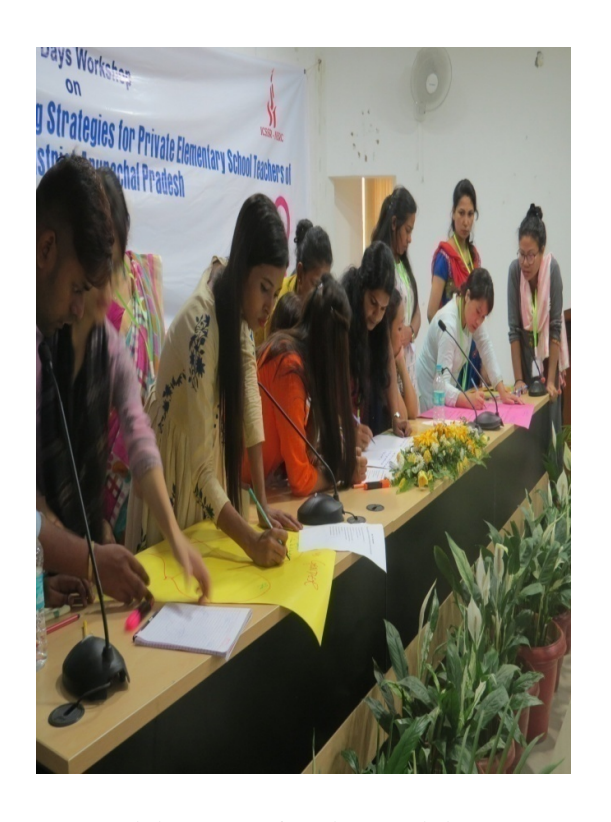
Participants performing Activity