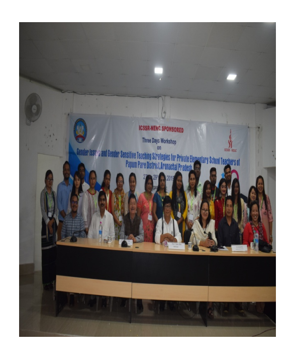
Group Photo Participants with Registrar, Dean (Education) Dean (DSW ) and Coordinators