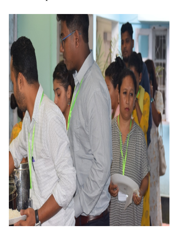
Participants having Lunch