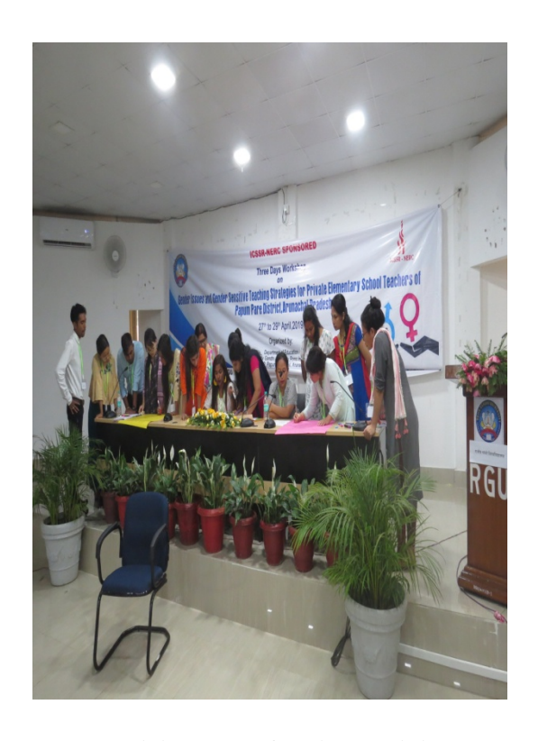
Participants performing Activity