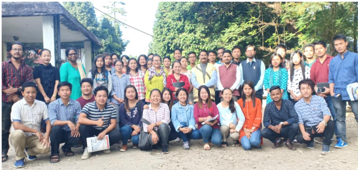
Department of Social Work Students and Faculties with the Hon'ble Vice-Chancellor, RGU