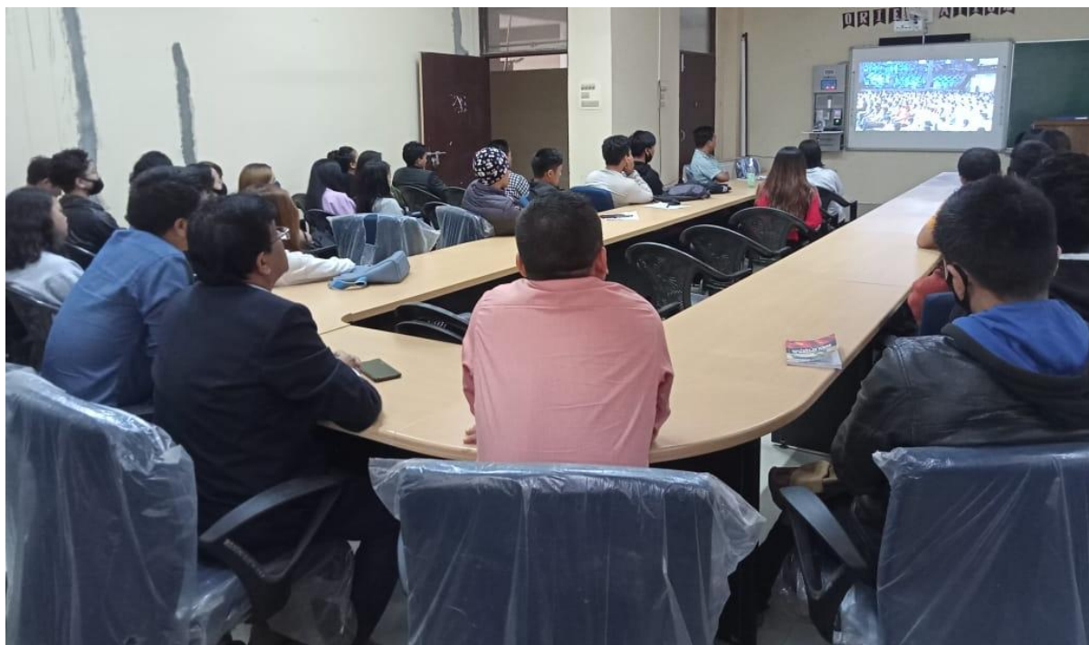
Students and Faculty Members participating in 5 th Edition of PPC 2022