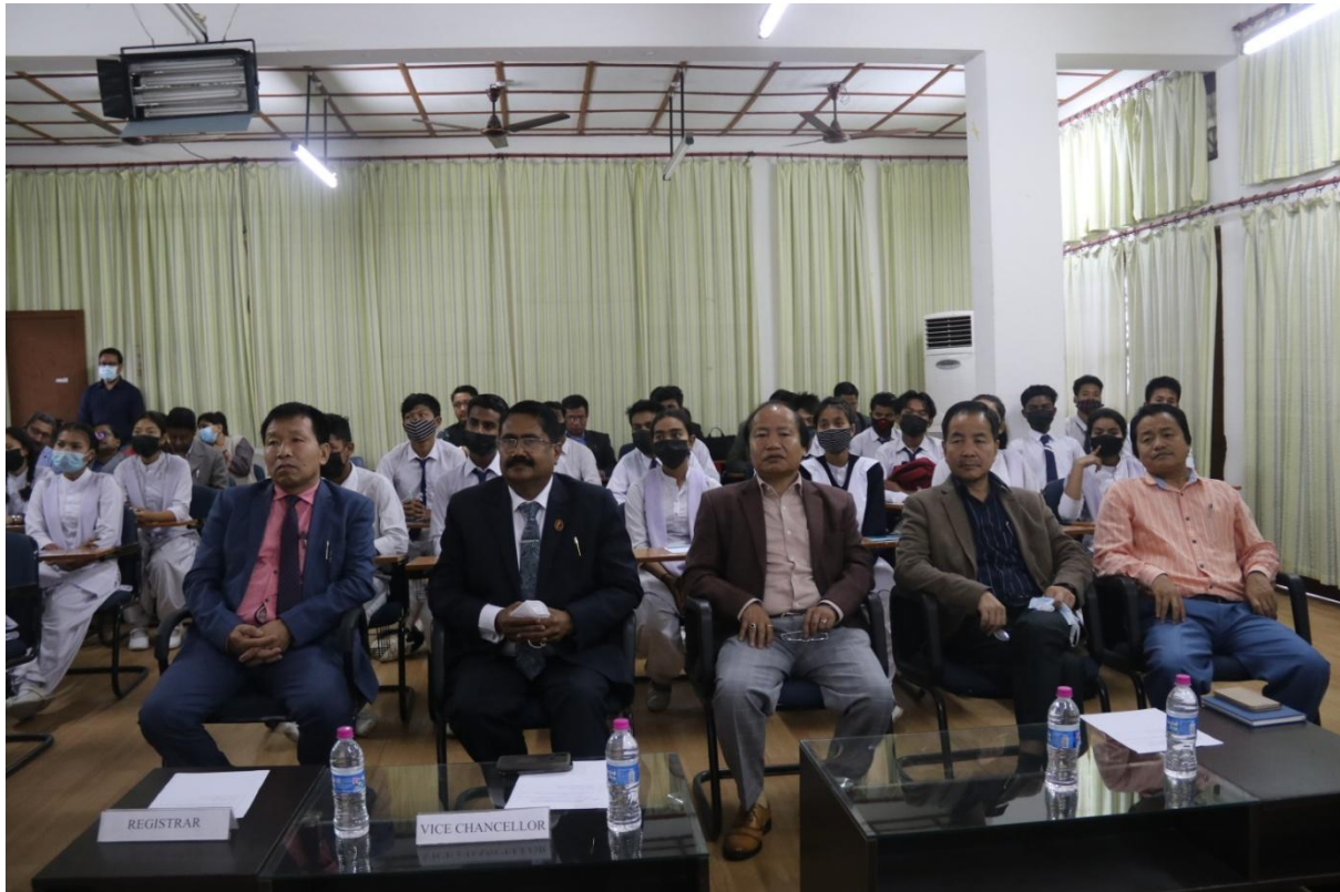
Hon'ble Vice Chancellor, Registrar, Statutory Officers and Deans of Various Faculties along with School Children Participating in 5 th Edition of PPC 2022