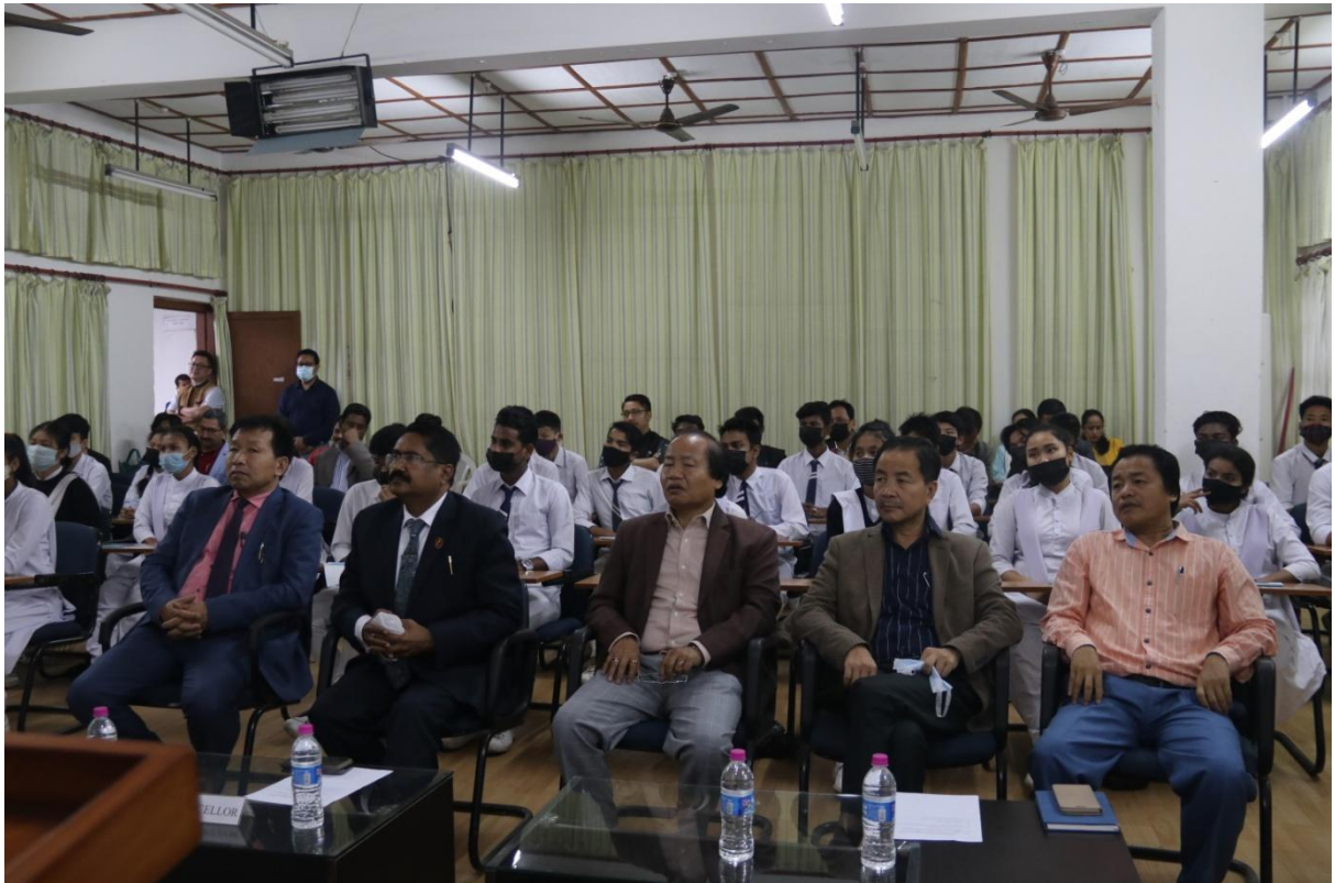
Hon'ble Vice Chancellor, Registrar, Statutory Officers and Deans of Various Faculties Participating in 5 th Edition of PPC 2022