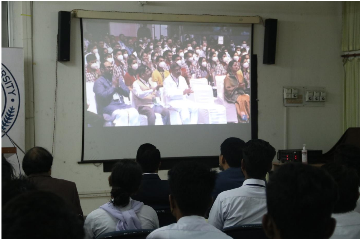
Hon'ble Union Minister of Education Shri Dharmendra Pradhan in 5 th Edition of PPC 2022