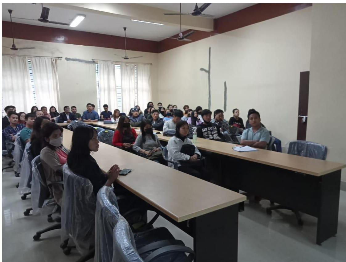
Students participating in 5 th Edition of PPC 2022