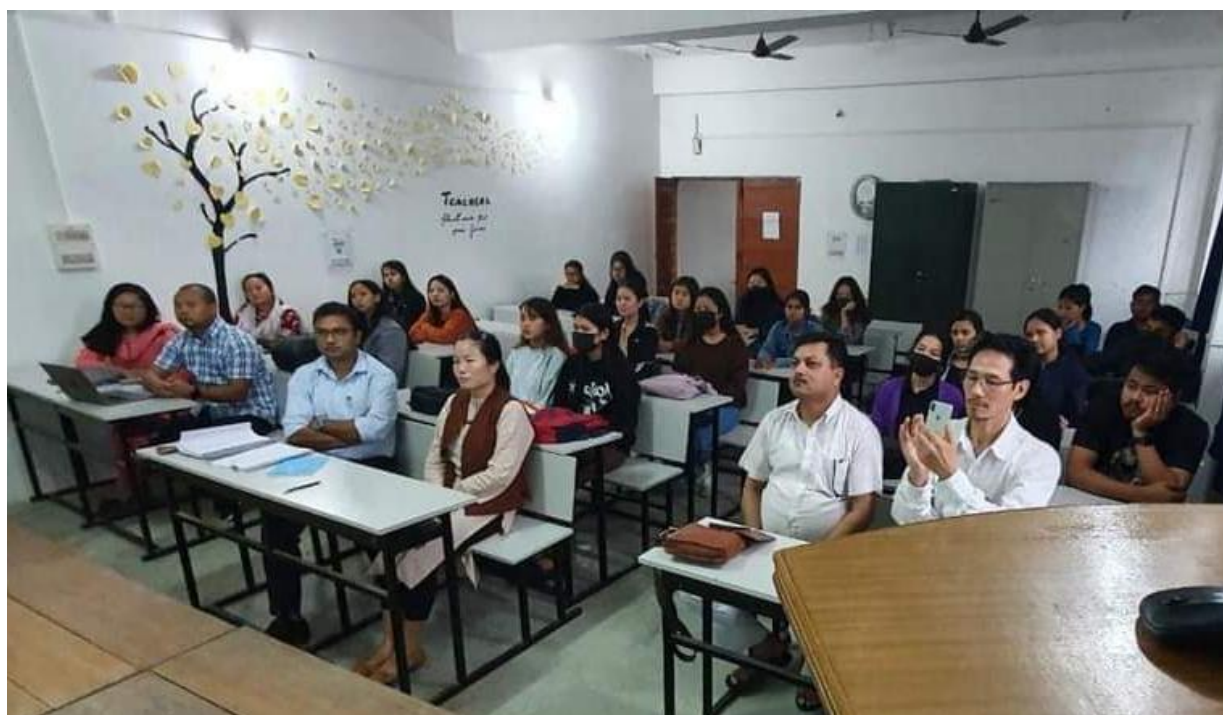
Students and Faculty Members participating in 5 th Edition of PPC 2022