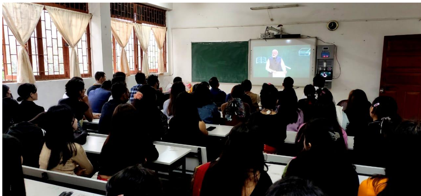
Students participating in 5 th Edition of PPC 2022