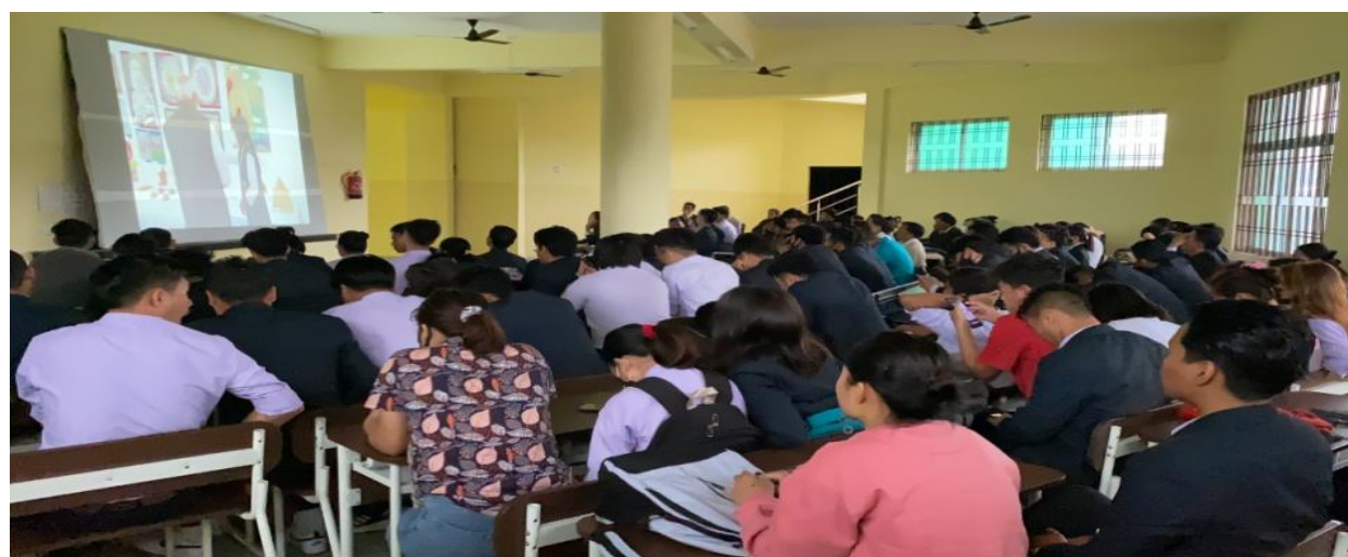
Students and Faculty Members participating in 5 th Edition of PPC 2022