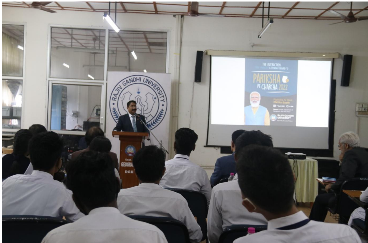
Hon'ble Vice Chancellor Addressing the School Children during 5 th Edition of PPC 2022