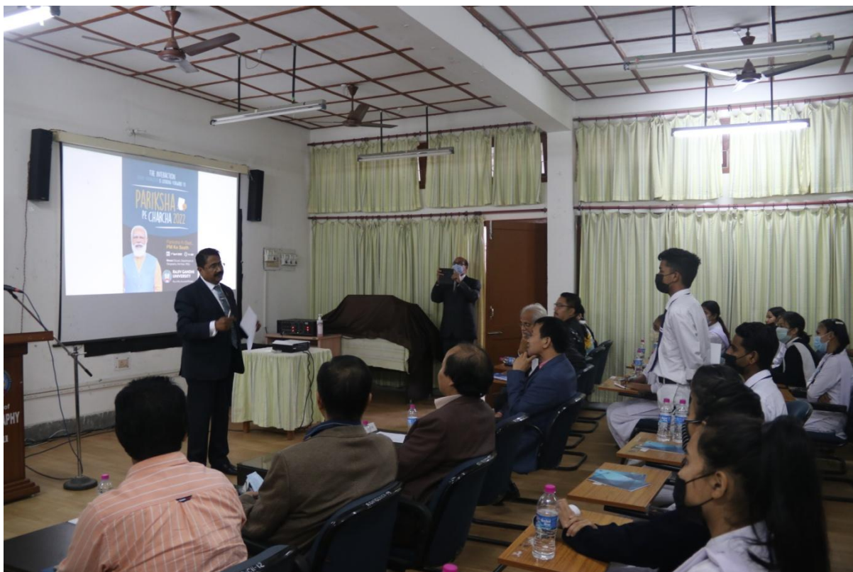
Hon'ble Vice Chancellor Interacting with the School Children during 5 th Edition of PPC 2022