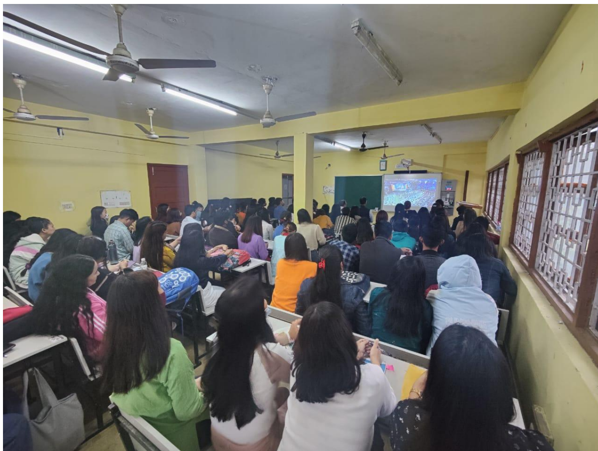
Students participating in 5 th Edition of PPC 2022