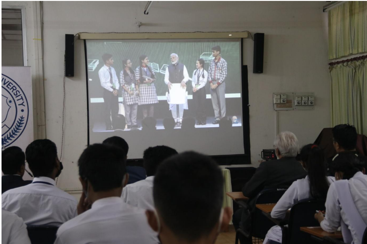
Hon'ble Prime Minister with Students Anchors of the Programme during 5 th Edition of PPC 2022