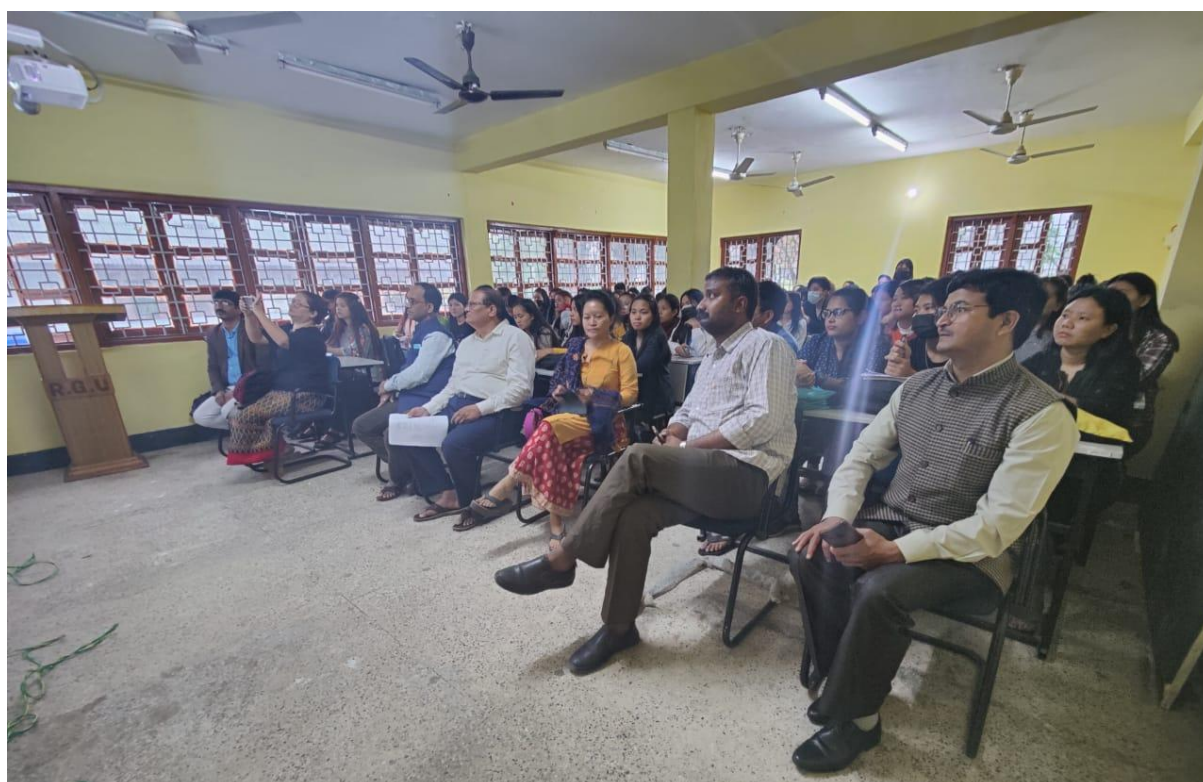
Students and Faculty Members participating in 5 th Edition of PPC 2022