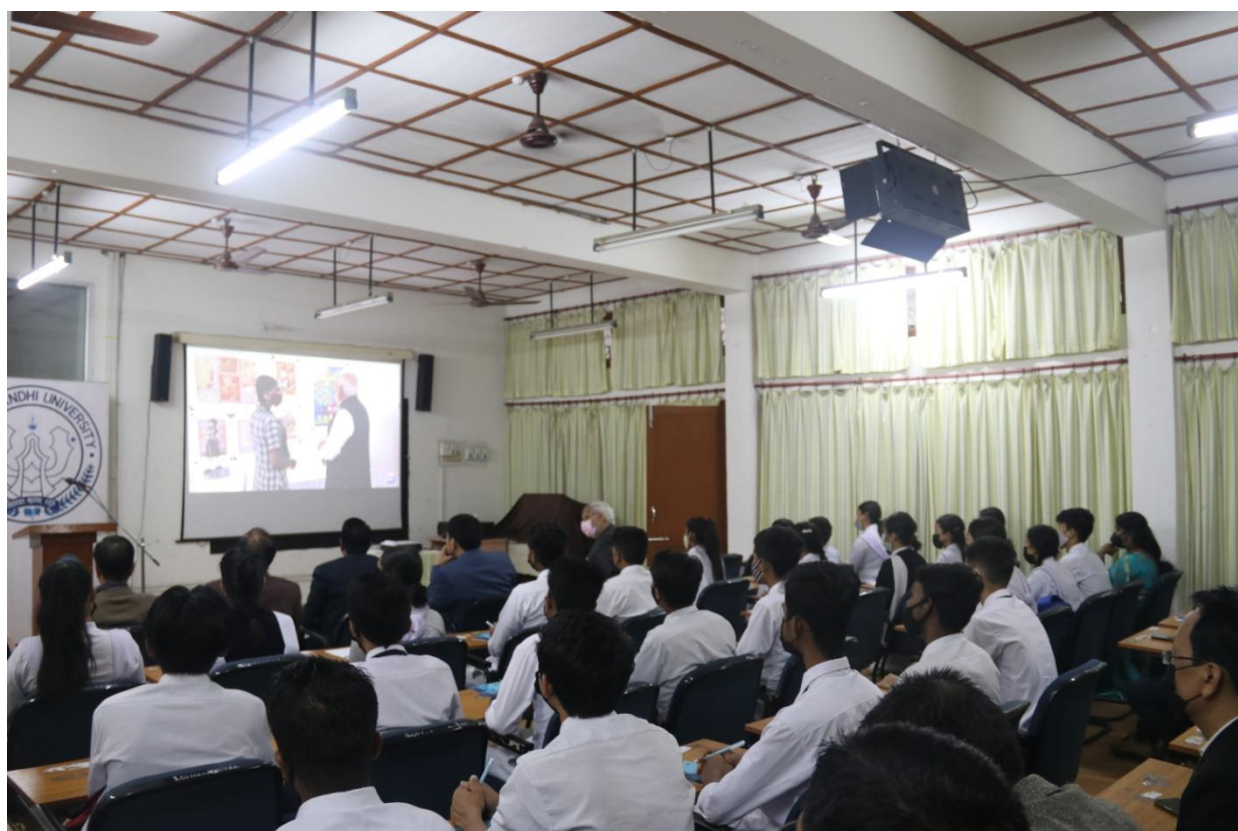
RGU Participating in 5 th Edition of PPC 2022