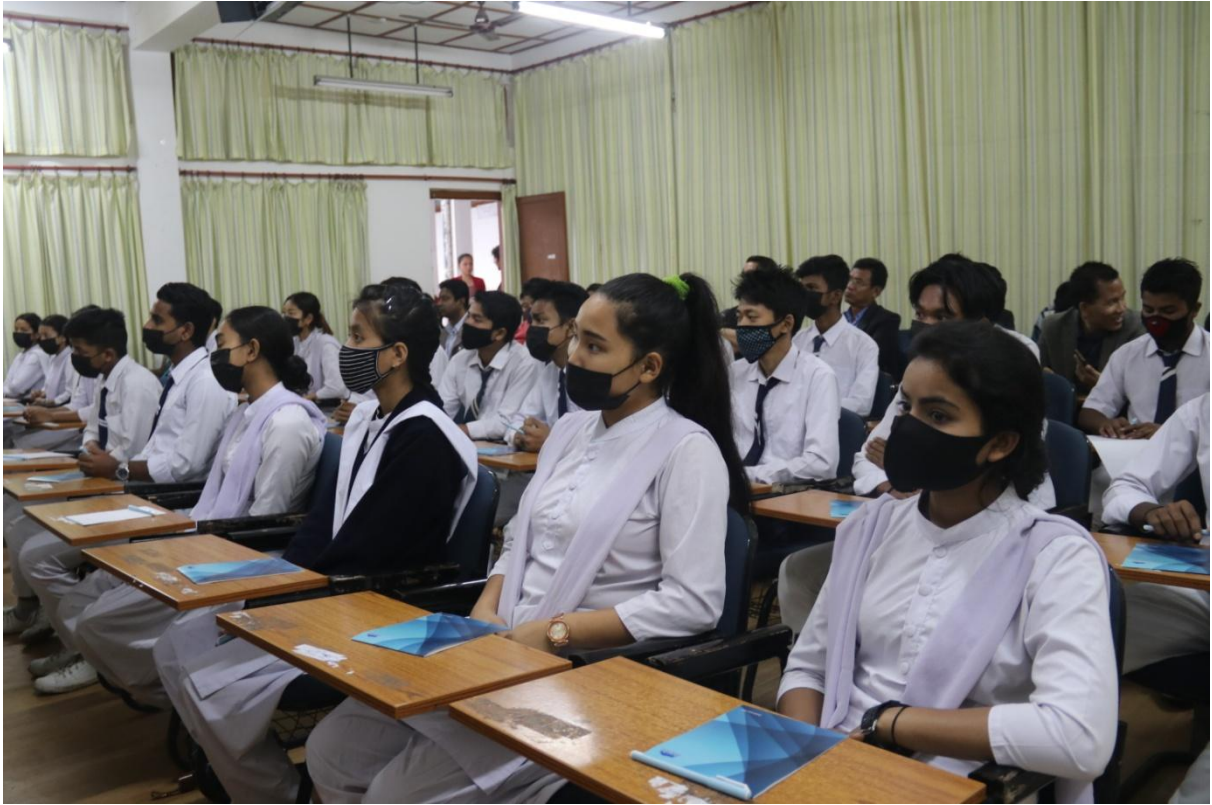
Students from Secondary School of RGU Participating in 5 th Edition of PPC 2022