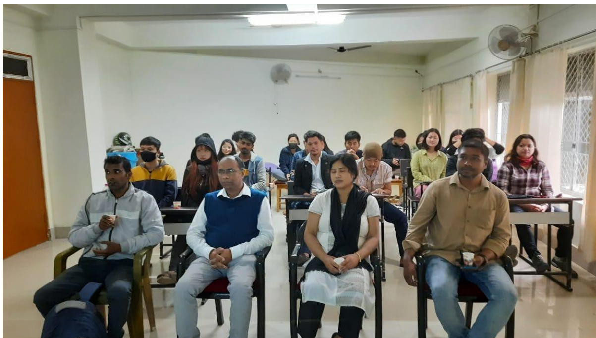
Students and Faculty Members participating in 5 th Edition of PPC 2022