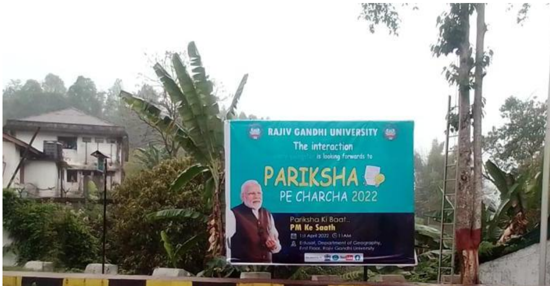
Banner Hosted in the University Premise