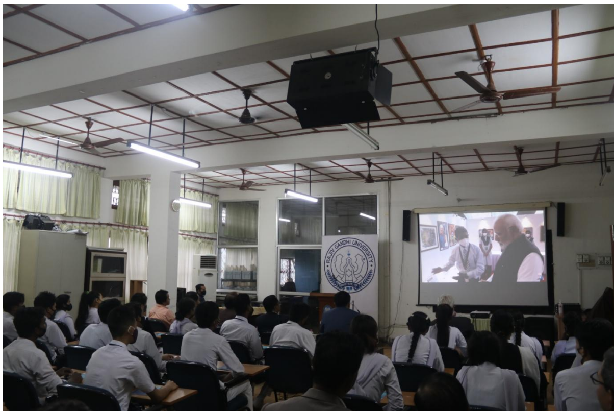
RGU Participating in 5 th Edition of PPC 2022