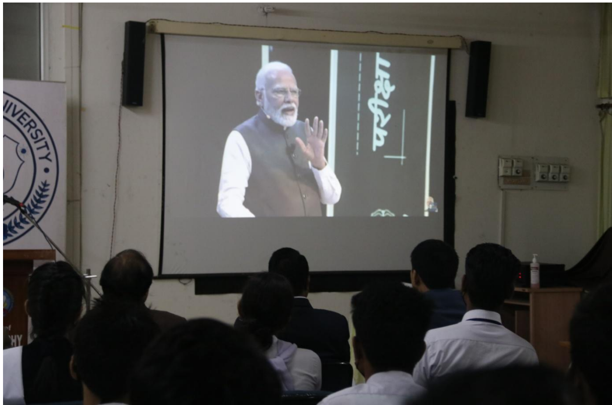
Hon'ble Prime Minister Shri Narendra Modi Addressing the Participants in 5 th Edition of PPC 2022