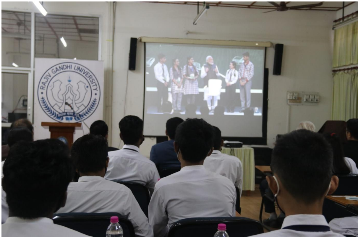
Hon'ble Prime Minister with Students Anchors of the Programme during 5 th Edition of PPC 2022