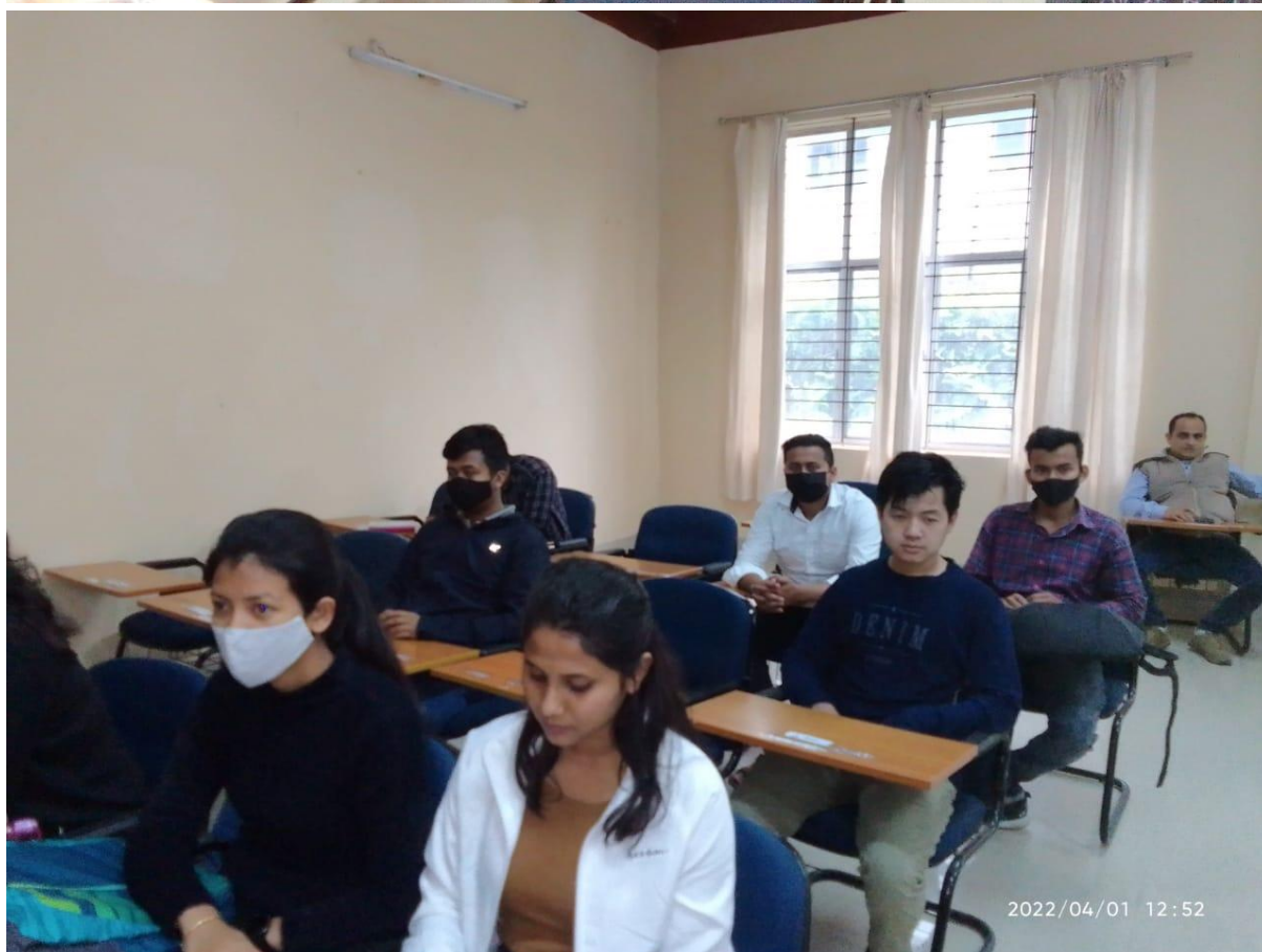
Students and Faculty Members participating in 5 th Edition of PPC 2022