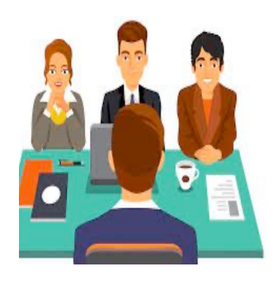
ORGANIZED BY PLACEMENT CELL RAJIV GANDHI UNIVERSITY (A CENTRAL UNIVERSITY) RONO HILLLS, DOIMUKH