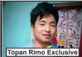
Topan Rimo Exclusive