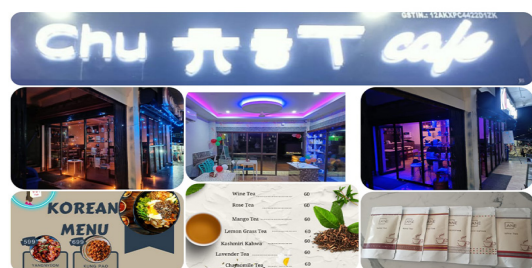
CHU CAFE NEAR GIRLS ALPHABET SCHOOL, DOIMUKH 7901109