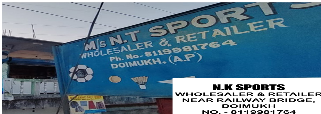
N.K SPORTS WHOLESALE & RETAILER NEAR RAILWAY BRIDGE, DOIMUKH NO. - 8119981764