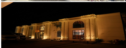
SANGO VILLAGE NEAR SANGO CHEROLET, 6KM ITANAGAR