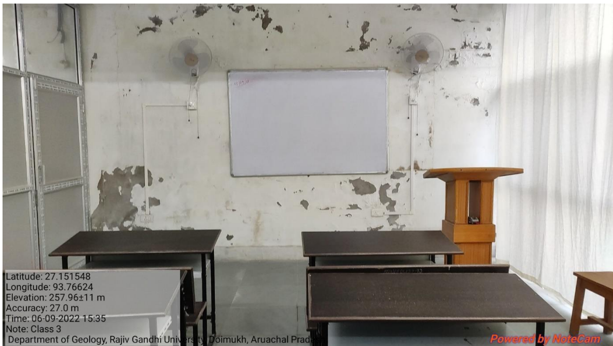
Latitude: 27.151548 Longitude: 93.76624 Elevation: 257.96±11 m Accuracy: 27.0 m Time: 06-09-2022 15:35 Note: Class 3 Department of Geology, Rajiv Gandhi University, Doimukh, Aruachal Pradesh