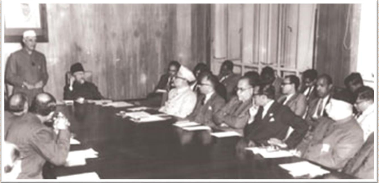
Maulana Abul Kalam Azad at the inaugural function of UGC, Bahadur Shah Zafar Marg, New Delhi (1954)