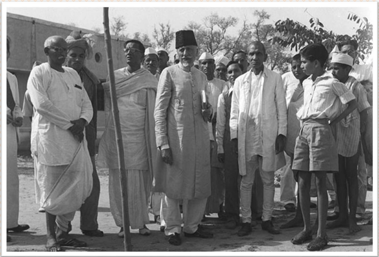
Maulana Abul Kalam Azad at the inaugural function of IIT, Khadagpur, Aug 18, 1951