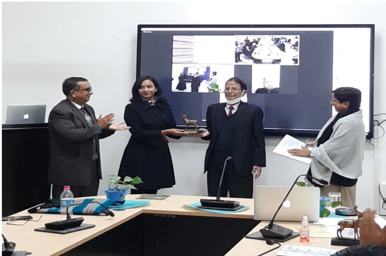
Photo: Valedictory session

5.4: Media Coverage: https://arunachaltimes.in/index.php/2021/12/17/22nd-annual-conference-of-nea-concludes/