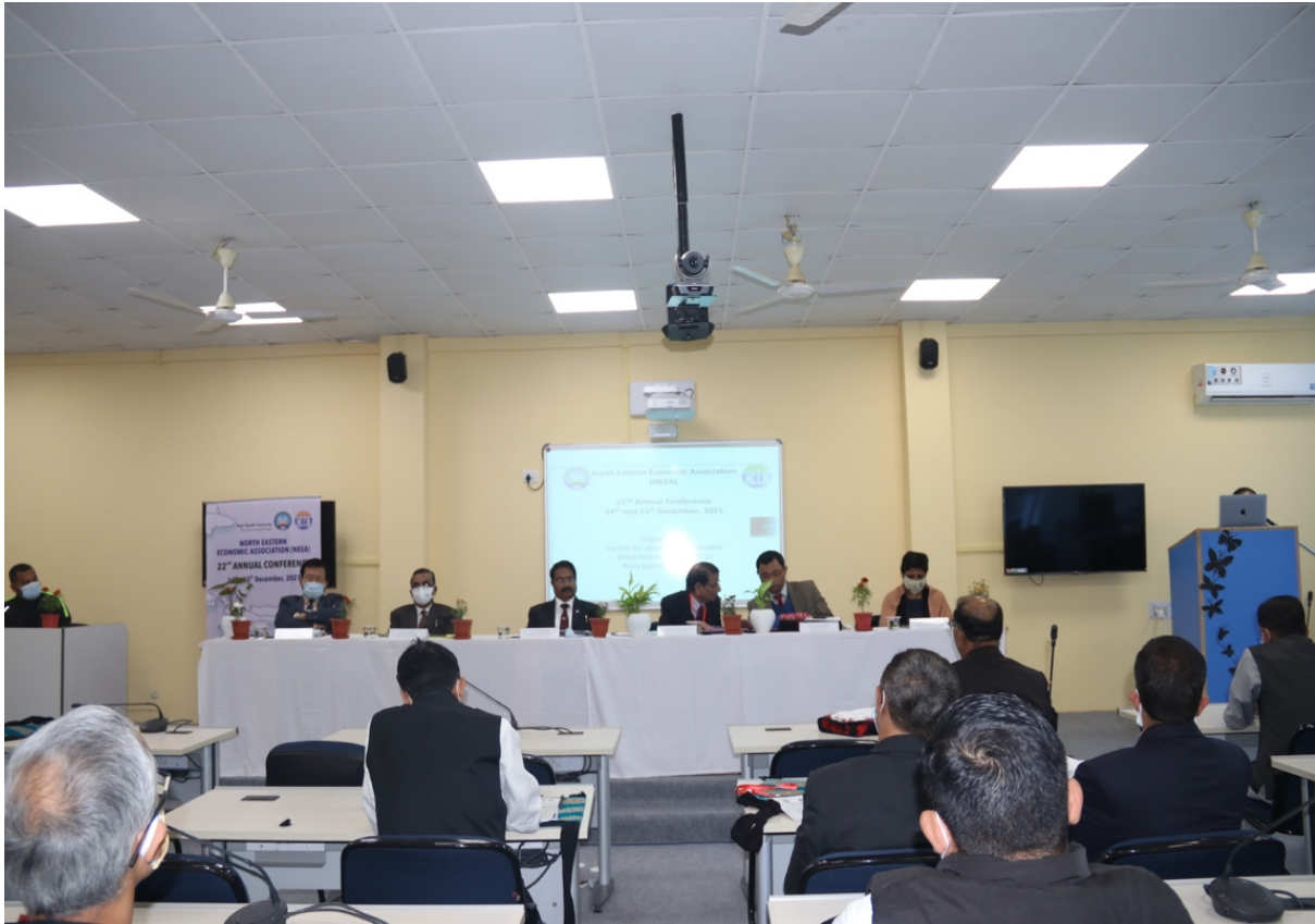
Photo: Inaugural Session