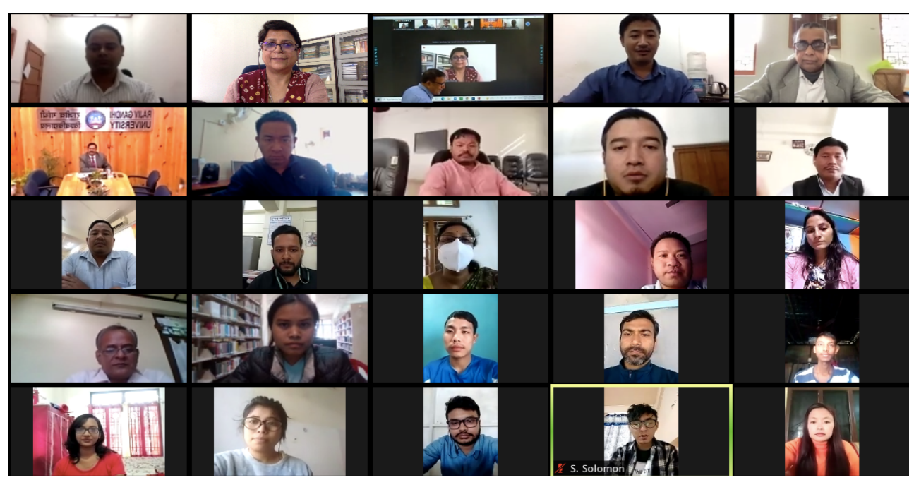
5.4: Media Coverage: <a href="https://arunachaltimes.in/index.php/2021/11/25/workshop-on-data-handling-using-spss-concludes-at-rgu/">https://arunachaltimes.in/index.php/2021/11/25/workshop-on-data-handling-using-spss-concludes-at-rgu/</a>