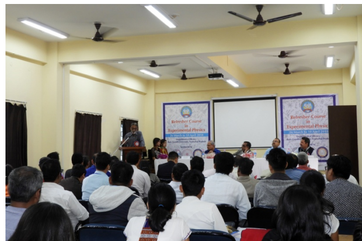
Inauguration of Course