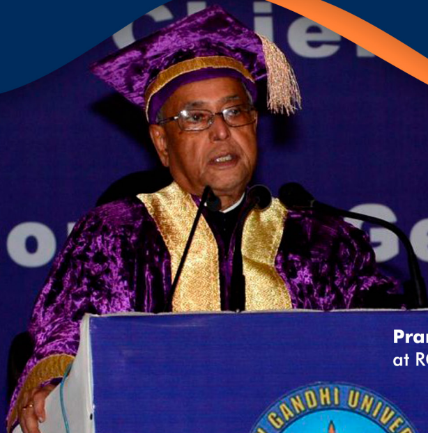
Pranab Mukherjee at RGU Convocation

Central and Browsing Centre Bank Facilities Shopping Complex Community Radio Station