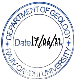
Signature of the HOD