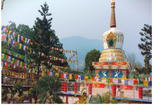
Img.1: The Gompa

The visitors were taken to a dam site located in Pare. They were mesmerised by the view and expressed their views on nature and development of the state.