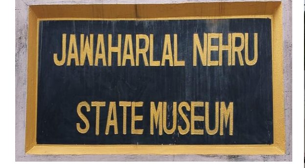
Img.5: Entrance of Jawaharlal Nehru State Museum