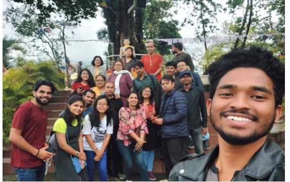
Img. 3: A moment from the Gompa