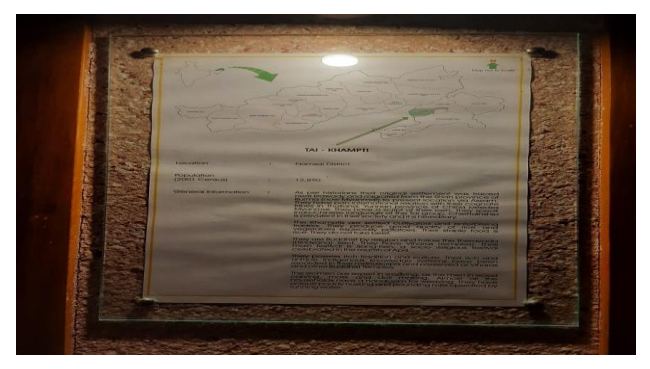
Img.4: Displayed details on various cultural aspects of Arunachal Pradesh