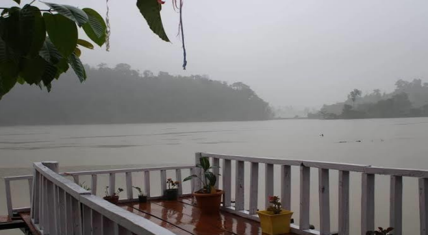
Img 6: View of dam site (Pare)