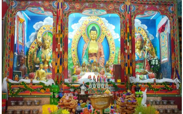
Img. 2: Interiors of the Gompa