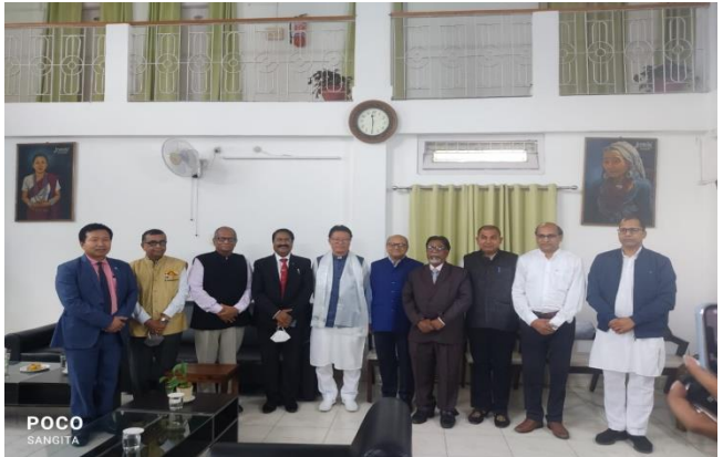
Image 4. Distinguished Guest at RGU Guest House with Hon'ble Minister of Education, Govt. of Arunachal Pradesh