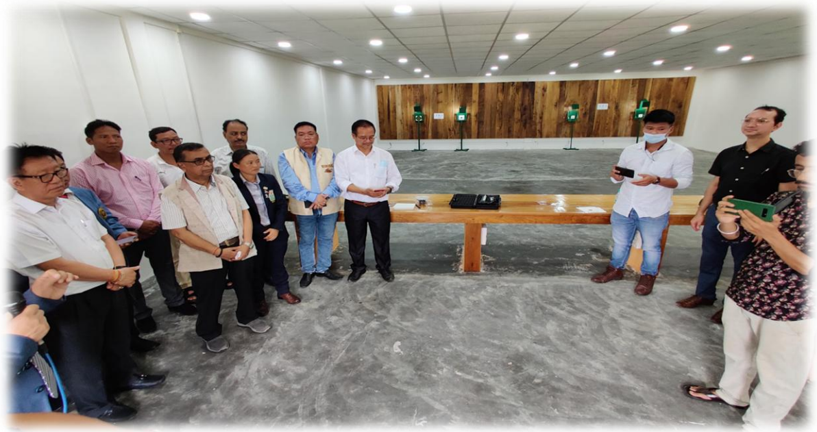
Inauguration of 10 M Air Rifle and 10 Mtr Pistol