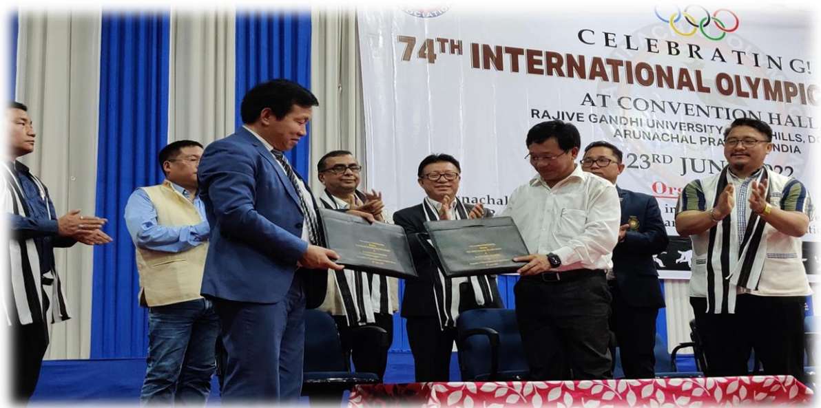
Signing of MOU Between AOA and NCSSR RGU