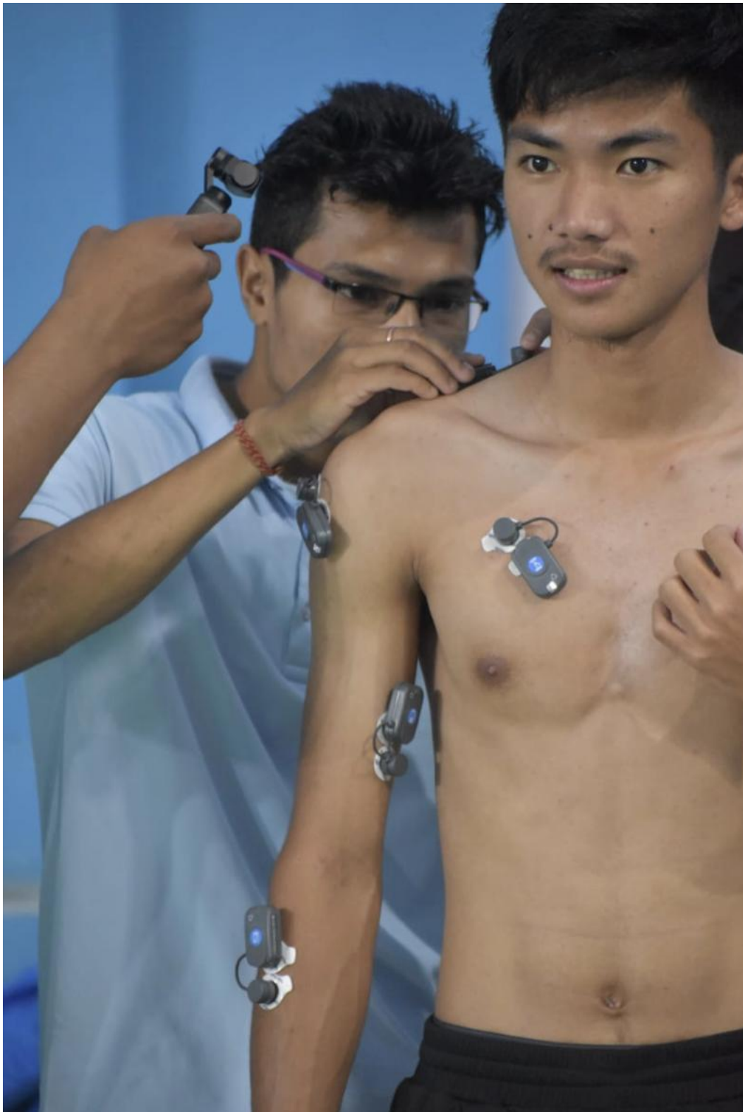
Research Scholar placing EMG Electrodes on a Badminton Player