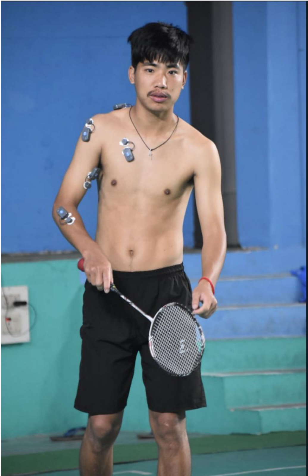
EMG Testing of Badminton Player