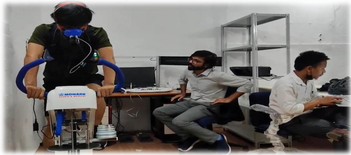
Anaerobic Ergo-meter Testing of a Player