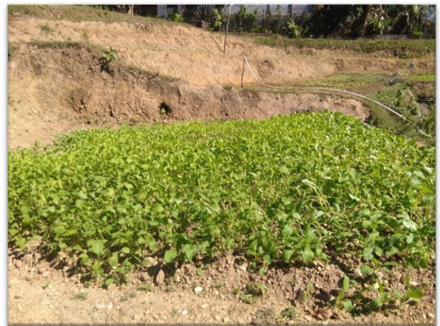
Organic Vegetables and Banana Plants