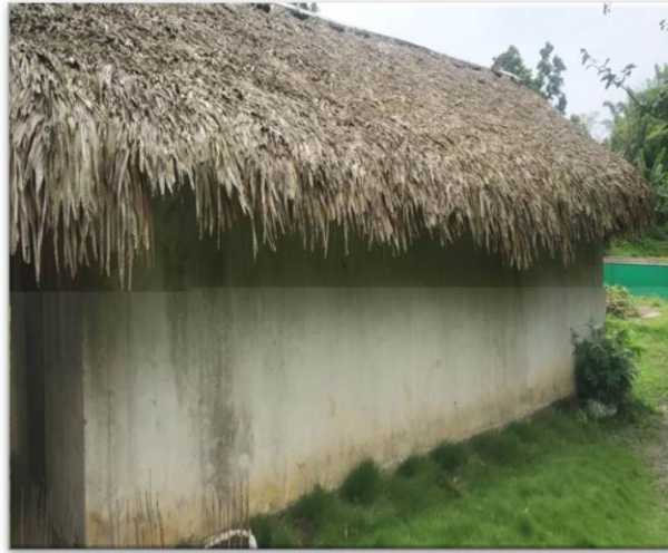
Mushroom Cultivation Centre