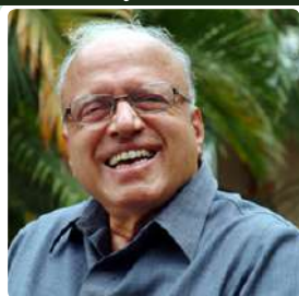
Prof. M.S. Swaminathan (7 August 1925 – 28 September 2023) Legacy Lives On