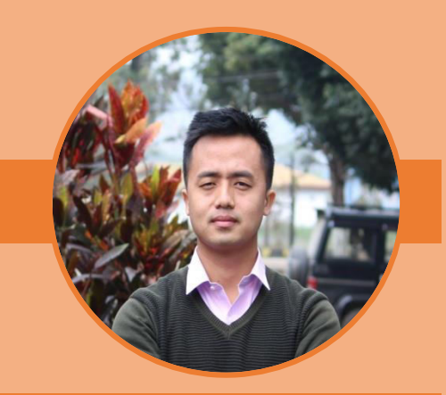
UGC NET (Social Work, 2017)