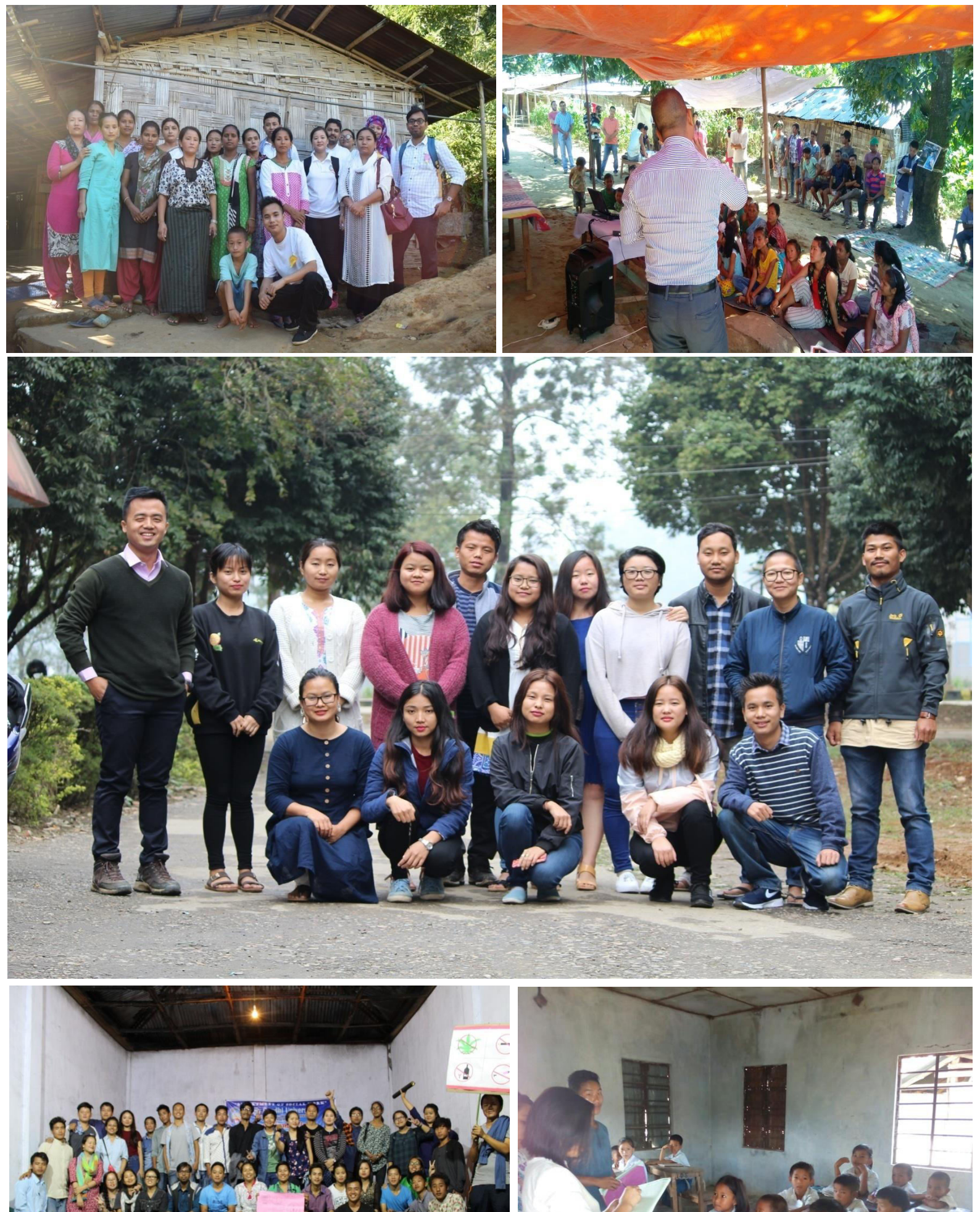
Compiled by Tomo Nayam, MSW IV SEM, RGU, 2017-188