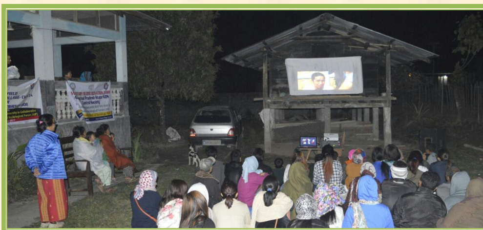
Evening entertainment session with villagers

Students and NSS volunteers have participated the 3 days “Special Camp” held at the Chimpu an adopted village of RGU-Community Development Cell under the aegis of Unnat Bharat Abhiyan. They have organized awareness programme, shramdhan, blood donation, sanitation and cultural programmes at the village. HoD and faculty of Sociology along with NSS Unit led the camp.