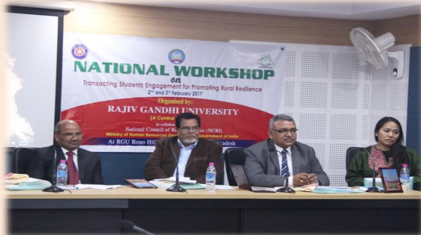
Guest and Resource Persons of the Workshop