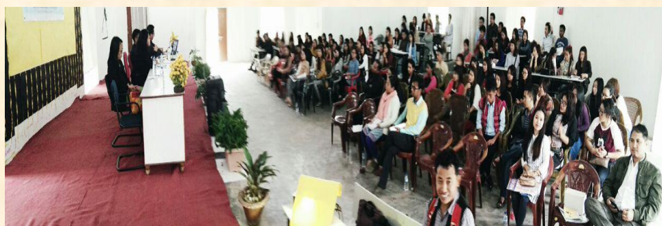
Panoramic views of the programme

A one-day awareness programme on Beti Bachao Beti Padao was organized at RGU Mini Auditorium in collaboration with RGNIYD, Seriperumbudr, Tamil Nadu.