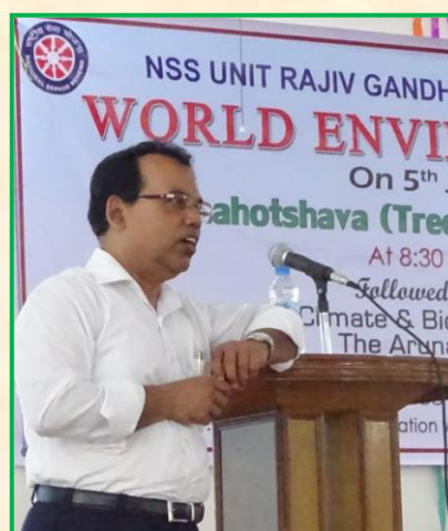
Chief Guest and Resource Person of WED