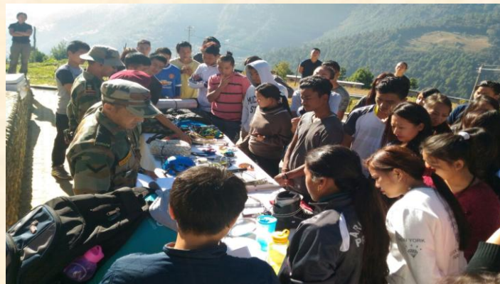
Army Officers (Trainers) Describing Mountaineering Tools to NSS Volunteers

Ten days “Mountaineering and Adventure Camp” from 1 st to 10 th November 2016 at NIMAS (National Institute of Mountaineering and Allied Sports), Ministry of Defence, GoI, at Dirang, Arunachal Pradesh organised by NSS Regional Office of Guwahati for NSS volunteers of two state of North East i.e. Arunachal Pradesh and Nagaland.