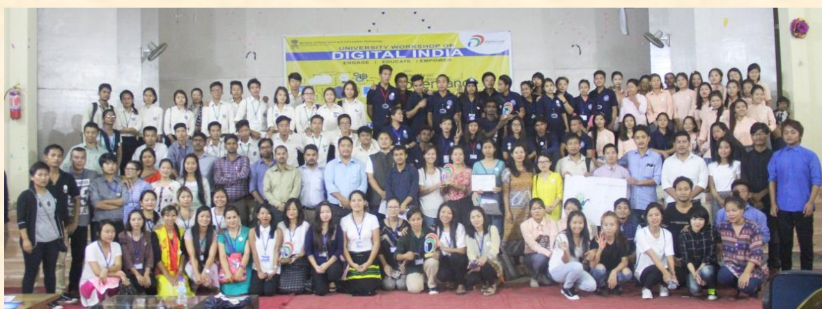
Digital India Workshop Participants

Digital India Workshop was organised by the NSS Unit in collaboration with National e-Governance Division, an independent division of Department of Electronics and Information Technology (DeitY), and Department of Youth Affairs at Rajiv Gandhi University (RGU) on 20th September 2016. The workshop was participated by faculty, students and NSS volunteers from RGU affiliated colleges. The colleges were the Government Women College (GWC), Dera Natung Government College (DNGC), Don Bosco College (DBC) and Vivekananda Kendra College of Teacher Education (VKCTE) and RGU NSS volunteers.